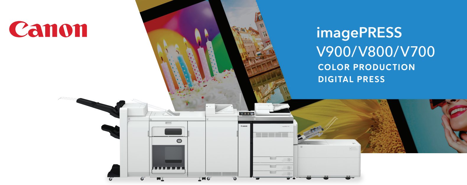
imagePRESS V900 shown with optional accessories.