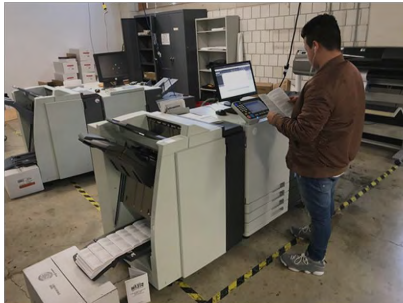
Figure 2: Student in the Graphic Design & Visual Communications Program at Somerville High School (MA)