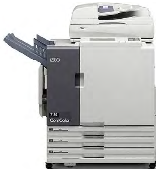
Figure 3: The RISO ComColor X1 7150

The RISO ComColor X1 7150 is a full-color sheet-fed inkjet printer featuring print speeds of up to 120 ppm at 600x600 dpi and a maximum duty cycle of 500,000 impressions per month. The printer provides high-speed production at a very low cost using newly-developed ink technology that reduces ink transparency and improves black ink density. The ComColor reduces power consumption with an automatic power shut-off, is ENERGY STAR® Certified, and does not require a dedicated 220V power circuit to run. It can operate on a standard 110V outlet and is small enough to fit just about anywhere.