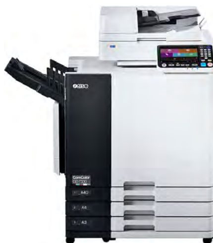
Figure 4: RISO's ComColor GD 7330

The RISO ComColor GD 7330 is a full-color sheet-fed inkjet device featuring print speeds of up to 130 ppm at 600x600 dpi and a maximum duty cycle of 500,000 impressions per month. The printer is engineered for high-production environments, providing high-speed color printing at a very low cost using newly-developed ink technology that reduces transparency and improves black ink density. It also leverages a fifth color (gray ink) to provide denser blacks and improved color reproduction and stability. Mr. Gerlach of Somerville High School states, "Our customers love the color quality that the fifth gray unit provides; it gives our projects an extra pop of color."